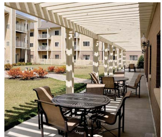
Example of Project-Based Voucher development model.

Conrad Apartments in north suburban Skokie rehabilitate two buildings formerly known as the Martha Drake Apartments. The Housing Opportunity Development Corporation will build 23 units, 12 of which will receive PBV assistance for supportive services housing. These apartments offer excellent access to public transit and employment expanded economic opportunities in the north suburbs.