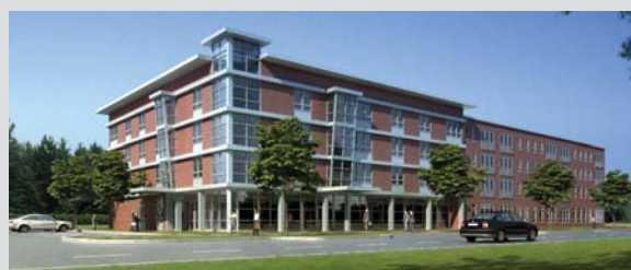
Rendering of future Summit Senior is a 69-unit residential rental community that will include nine Project-Based Voucher units.

The Summit Senior Housing complex is "shovel-ready" and poised to receive an $8.165 million grant under the American Recovery and Reinvestment Act (ARRA). It also received an additional $2.1 million in funding from the Cook County Department of Planning and Development.